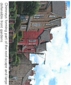
Chimneys forming part of the roof-scape and large defensible front gardens