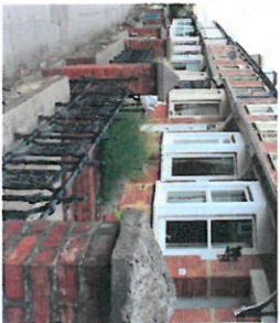
Chimneys forming part of the roof-scape and small defensible front gardens for privacy and storage

Level of landscaping: low Level of hard standing: high Potential for further landscaping: moderate on paths