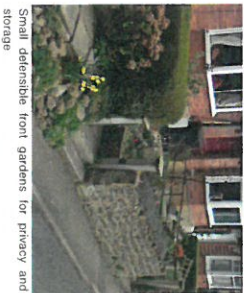
Small defensible front gardens for privacy and storage