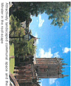
Attractively landscaped communal spaces and the Minster in the roof-scape