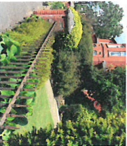
Large defensible front gardens for privacy, parking and storage

Level of landscaping: moderate Level of hard standing: moderate Potential for further: low due to the need for paths and roads as it is the main thoroughfare through Ilminster