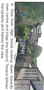
6. View from High Street looking down towards town centre and ridge line beyond. Terrace follows topography and frames the view.