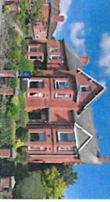
Villa set above the street with a positive relationship of surveying the street but maintaining privacy.