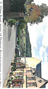
5. View from apex of Station Road looking over the valley to the southern ridge line from the terraces.