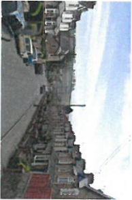
5. Terraces following the topography and framing the view of Herne Hill beyond.