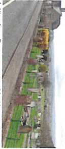
1. View from Beacon graveyard looking south-west over the west of Ilminster.