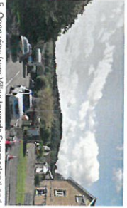
5. Open view from Villas towards Summerland and Herne Hill Beyond