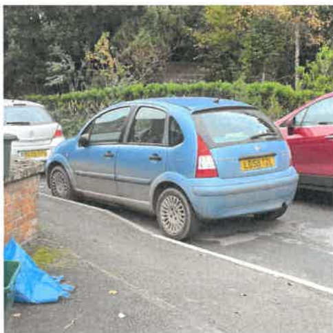
Car parked over Westbound (a) H Bar

Recently, residents and commercial vehicles have been parking over these H Bars making the road conditions very dangerous and visibility very poor for cars and pedestrians. Examples of the problems are shown here: