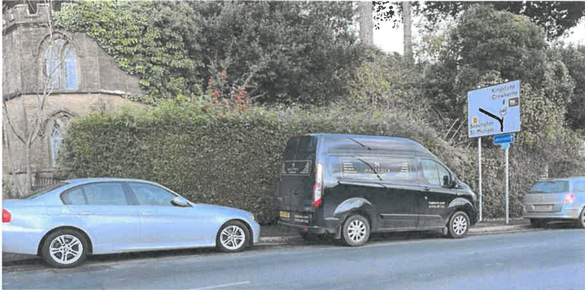
Car and Van totally obscuring Eastbound H Bars and footpath

We, the undersigned, request an application is made to South Somerset District Council by Ilminster Town Council to have double yellow lines in place instead of white H Bar lines which are no use (as they are being parked over daily) nor enforceable by Police or Civil Enforcement Officers.