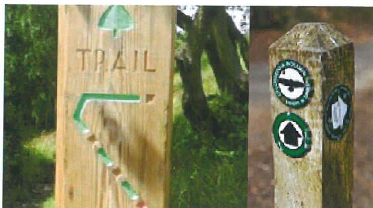
An comparison of an engraved waymarker and a simple disk waymarker post.

The waypoint markers can be fitted to two sides of the post, this will allow walkers to complete the routes no matter which direction they happen to be walking in. To ensure we have sufficient directional markers we should order sixteen green arrows, sixteen amber arrows and twenty four red arrows. These directional arrows could be made to contain the Ilminster Town Council text, which would help inform users that their local council has provided this service.