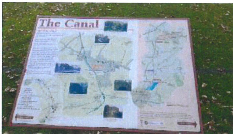
Current Interpretation Board located at the Ilminster Canal.

The Interpretation Boards would be similar in design to the current board installed at the canal; metal in construction and of a lectern design. If required the graphic style could be made to closely match this for continuity.