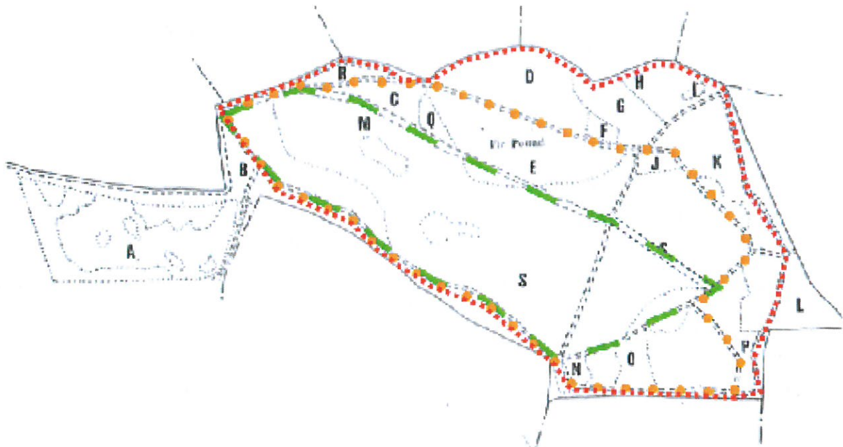
Map of Herne Hill illustrating the proposed access routes.

Finally, the Red route takes walkers around the perimeter pathway. The red route is the longest track within the site and includes the steepest inclines and does not utilise any of the steps found within the woodland. This route is 2.14km in length.