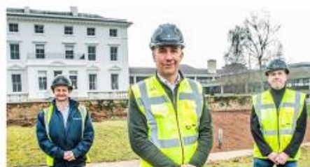
Winslade Park, Clyst St. Mary